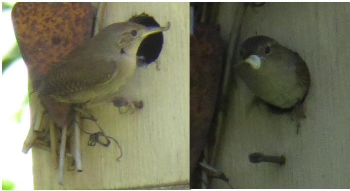
House Wren entering a neighbor's nest box (left) and removing a fecal sac from the nest box (right).

lucky and they even stayed in that spot long enough for me to run back inside and grab my camera!