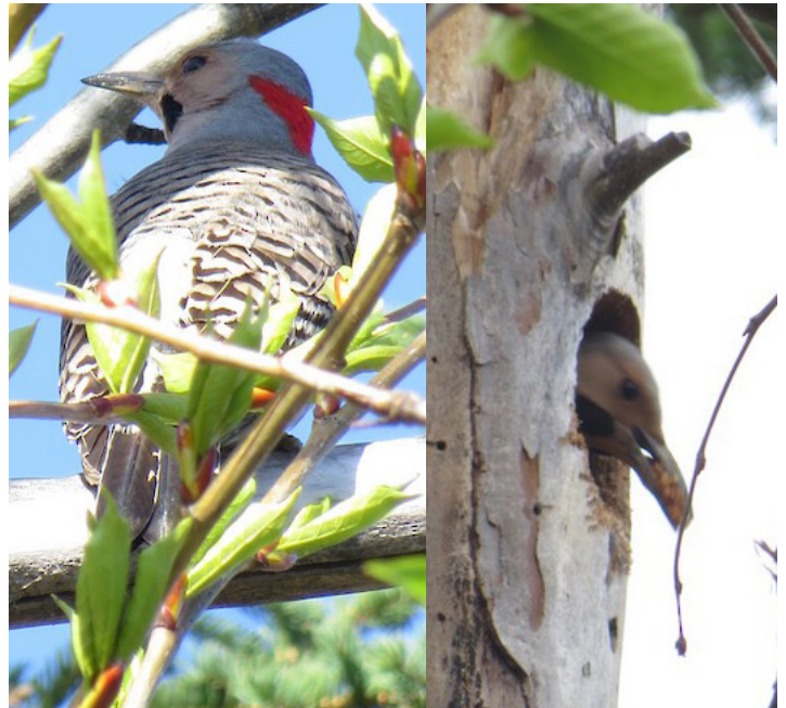
Male Northern Flicker excavating the cavity. Several times I saw the female poke her head into the cavity and then leave. A few minutes later, I would see the male return and start excavating some more. I imagined that she kept telling him that it still wasn't good enough!

On another day, I walked over to help my neighbor by bringing in his mail, and I observed a Chipping Sparrow carrying some food, so I stopped and watched where it went