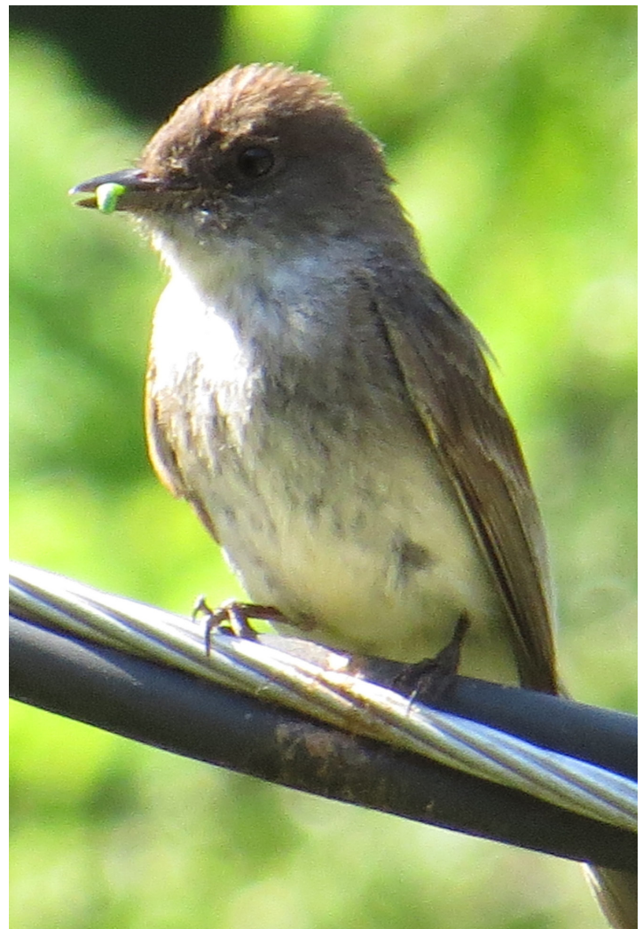
Eastern Phoebe carrying food to feed nestlings.