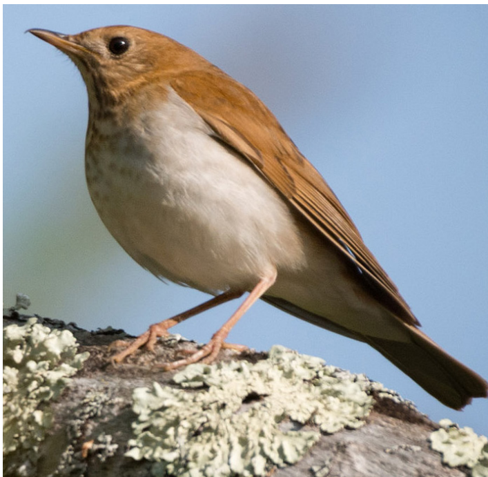
Veery, often heard during dusk.

As day gave way to night and the moon rose high into the sky, the changing of the guard was more complete. Most of the evening voices would drop off, while a few others joined in. On clear, moonlit nights Eastern Whip-poor-will sang their onomatopoeic songs across the state. William Faulkner described their voices as like “liquid silver”. When you have heard a chorus of 3 or more birds singing ceaselessly together under the full moon, it is hard to contest this quality. Barred Owls, Saw-whet Owls, and even a few Long-eared Owls were reported to have called during this later survey window. The Ovenbird, a ground-nesting warbler species, also was regularly reported as singing after the moonrise. They were not singing their regular refrain of “teacher, teacher, teacher”, but rather gave a complex and