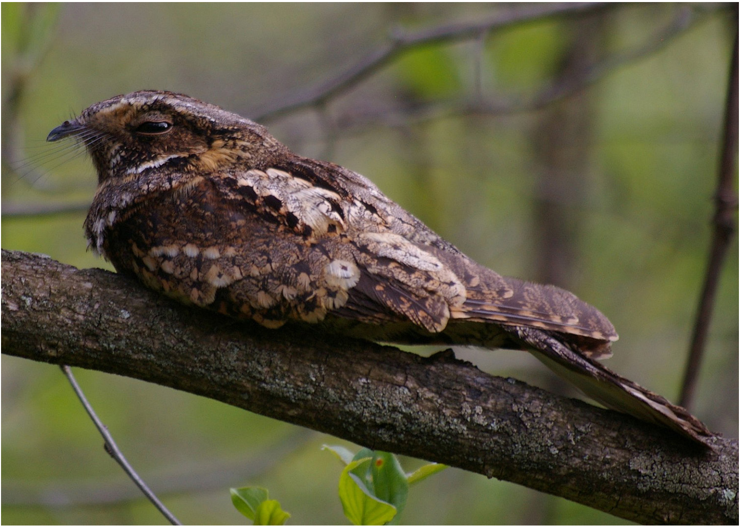
Eastern Whip-poor-will, with their nocturnal voices described as “liquid silver”.

garbled-sounding song with maybe one or two “teachers” thrown in just so you were sure who was responsible. Some points were devoid of birdsong, but rich with the calls of Spring Peepers, Wood Frogs, and American Toads in May and Gray Tree Frogs, Green Frogs, and American Bullfrogs in June. Lately fireflies have teemed along the roadsides and hung over the wetlands like will-o-the-wisps while the occasional Luna Moth floats by, illuminated by the moonlight. These sights and sounds make it hard to ever feel disappointed, even if you don’t hear any birds.