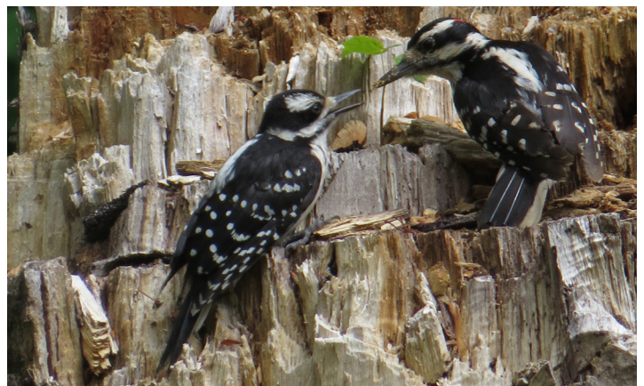
Adult Male Hairy Woodpecker feeding one of his fledglings. Fledgling birds will be fed by the adults for several weeks after they leave the nest.

A few days ago, I was taking my dog out to the back yard and happened to see two woodpeckers fly into a tree near my door. It being unusual to see two of them together like that, I decided to watch them for a while and see what was going on. They flew over to my neighbor's yard and I ran in to get my binoculars. Sure enough, it turned out to be an adult male Hairy Woodpecker who was being followed by a fledgling and I watched him feed it several times. I was